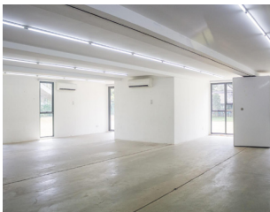
Multi-purpose Studio 1 & 2 $110 / hr