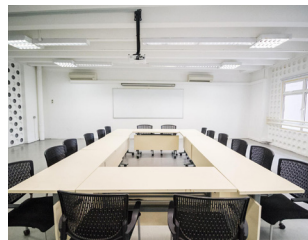
Meeting Room $45 / hr