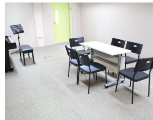
Music Studio † $35 / hr