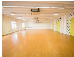
Multi-purpose Room 2 $110 / hr