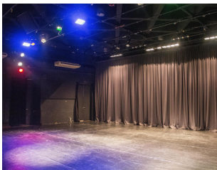
Black Box † $90 / hr $215 / 4hrs (Rehearsals only) †† $360 / 4hrs (Performances only)