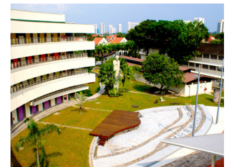
Amphitheatre $45 / hr

† Note: F&B is not allowed at this venue