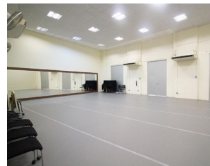
Multi-purpose Room 3 $70 / hr