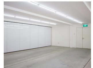
Multi-purpose Studio 1/2 $35 / hr